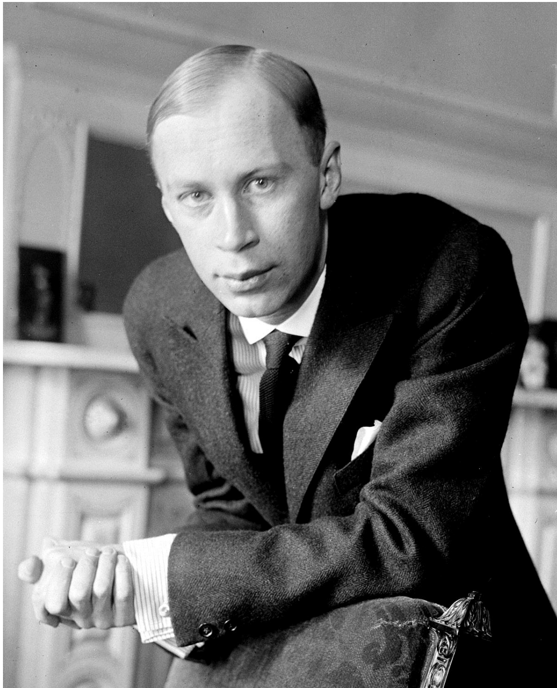
Sergei Prokofiev, taken 1918